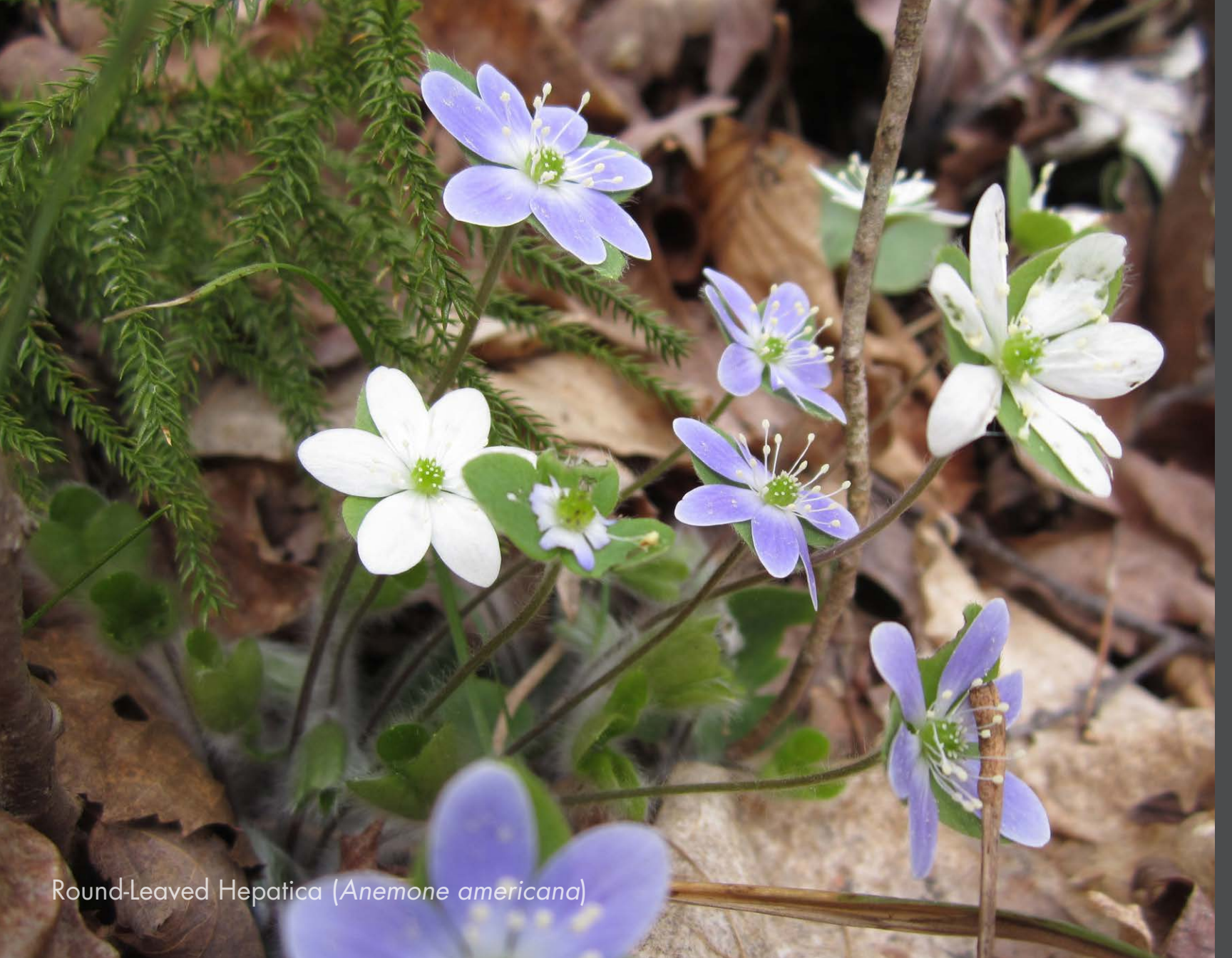
Round-Leaved Hepatica ( Anemone americana )