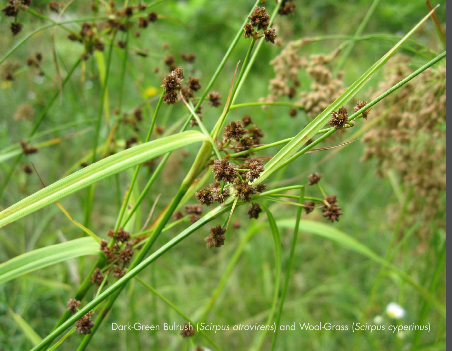
Dark-Green Bulrush ( Scirpus atrovirens ) and Wool-Grass ( Scirpus cyperinus )