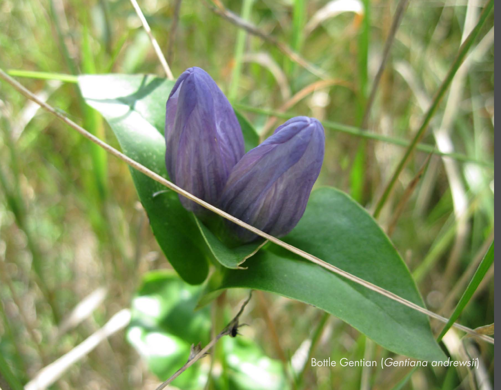
Bottle Gentian ( Gentiana andrewsii )