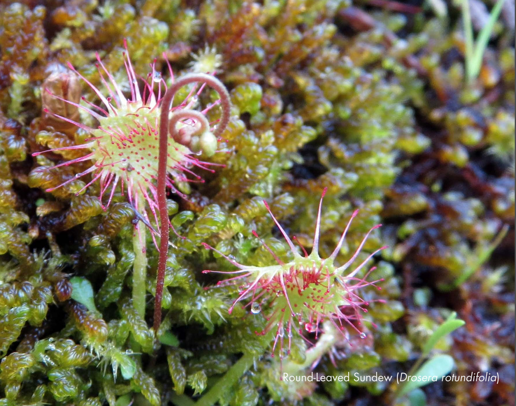
Round-Leaved Sundew ( Drosera rotundifolia )