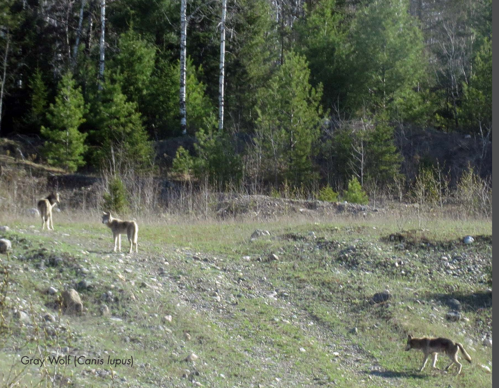
Gray Wolf ( Canis lupus )