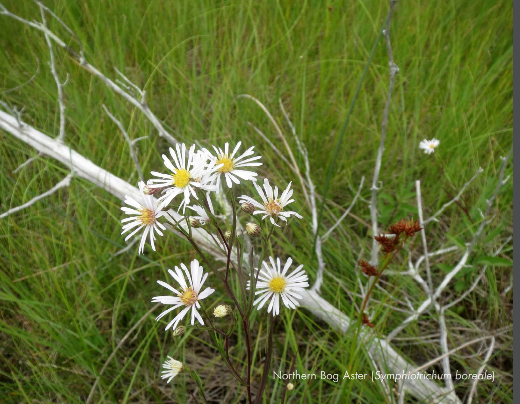
Northern Bog Aster ( Symphiotrichum boreale )