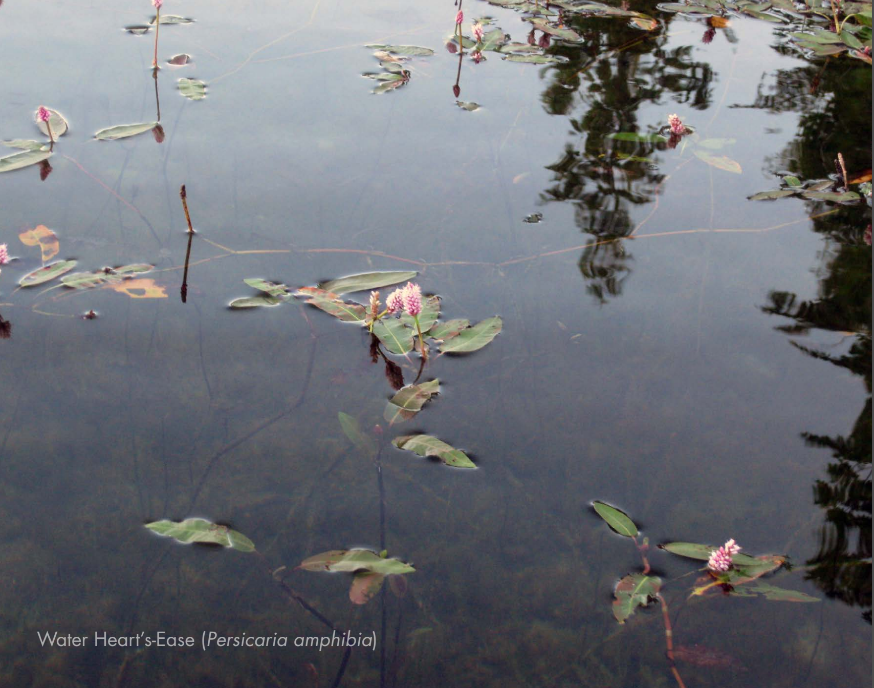
Water Heart's-Ease ( Persicaria amphibia )