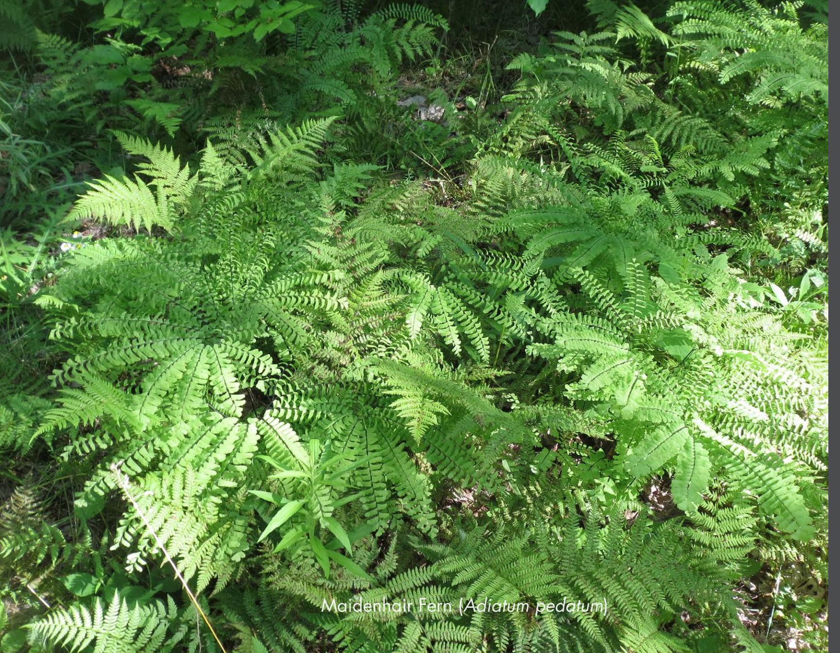
Maidenhair Fern ( Adiantum pedatum )