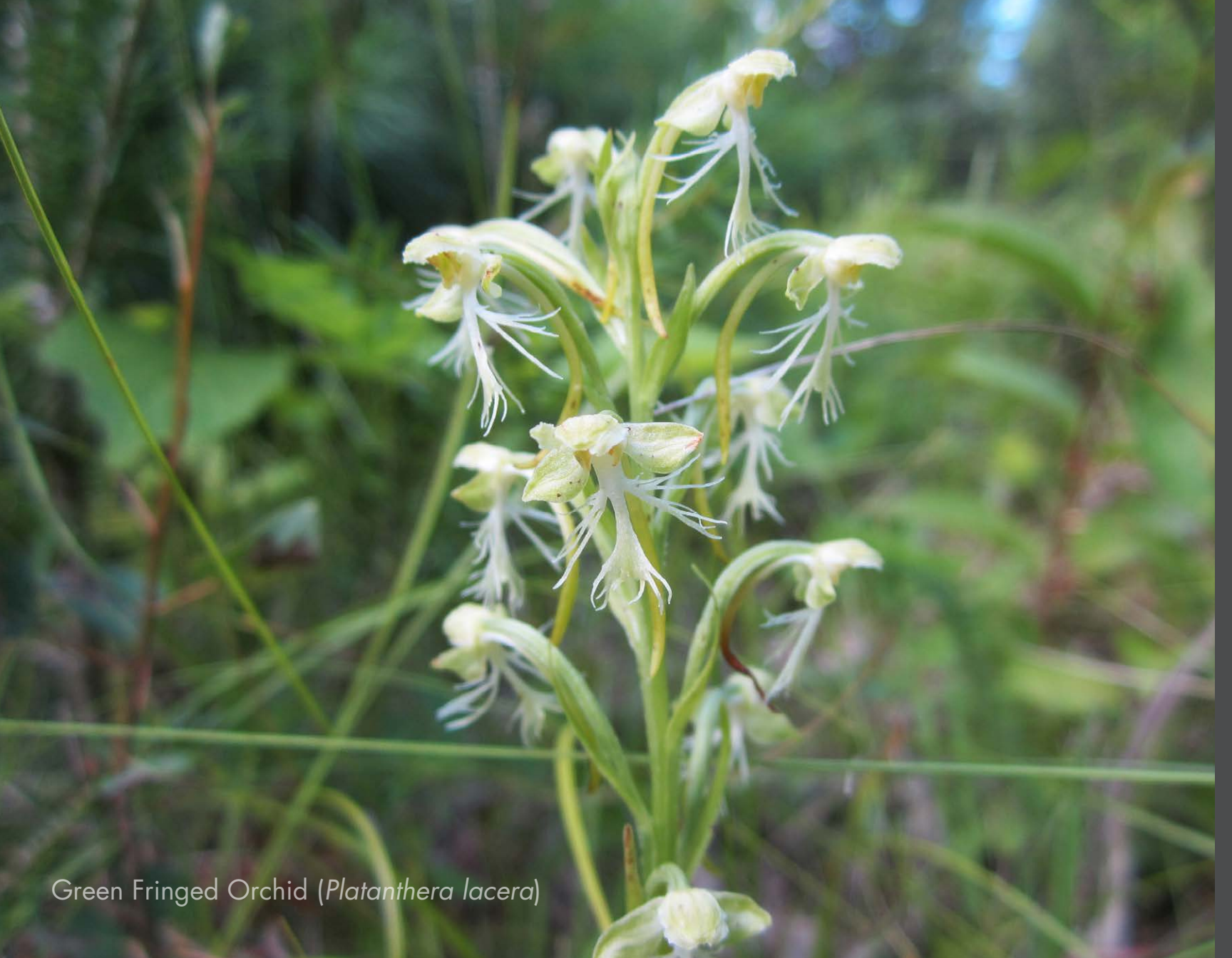
Green Fringed Orchid ( Platanthera lacera )