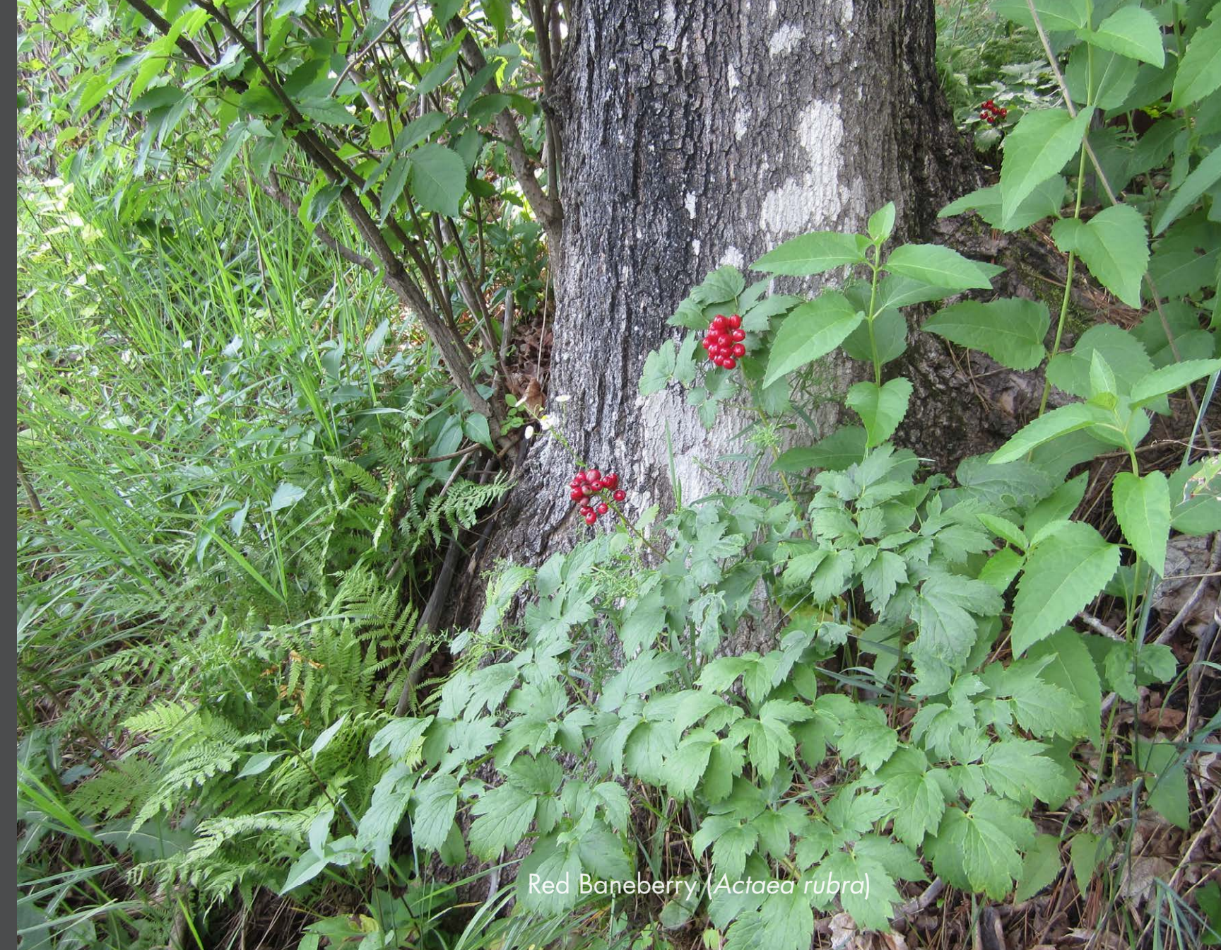
Red Baneberry ( Actaea rubra )