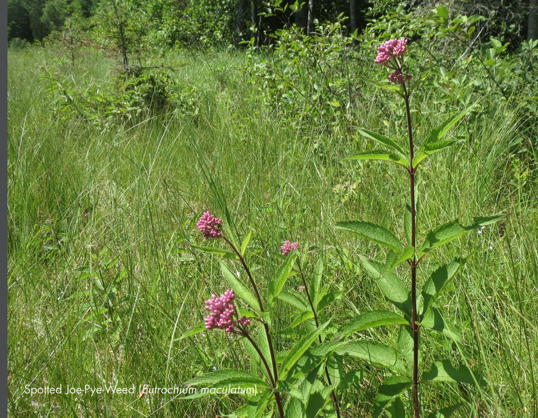
Spotted Joe-Pye-Weed ( Eutrochium maculatum )