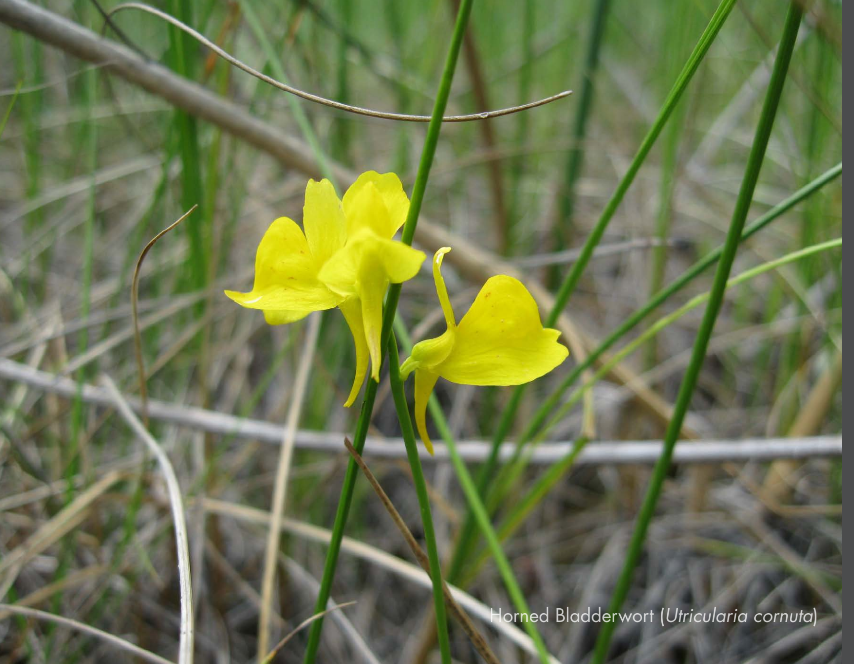
Horned Bladderwort ( Utricularia cornuta )