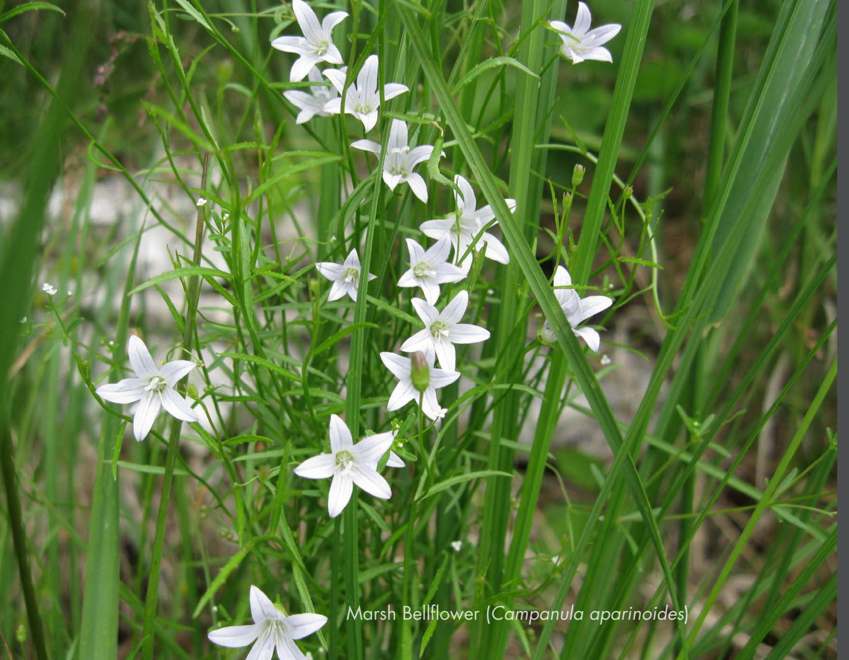
Marsh Bellflower ( Campanula aparinoides )