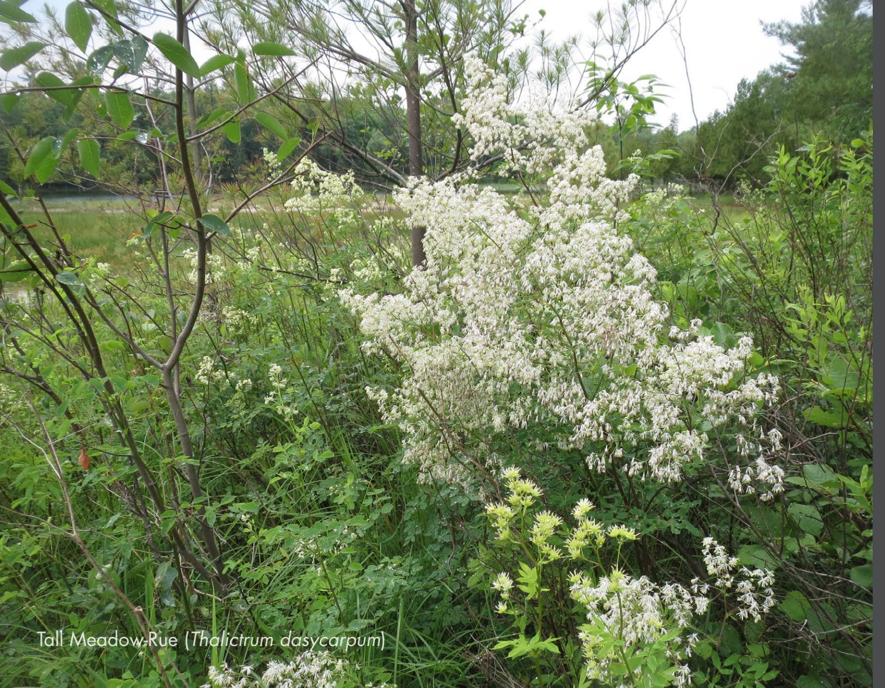
Tall Meadow-Rue ( Thalictrum dasycarpum )