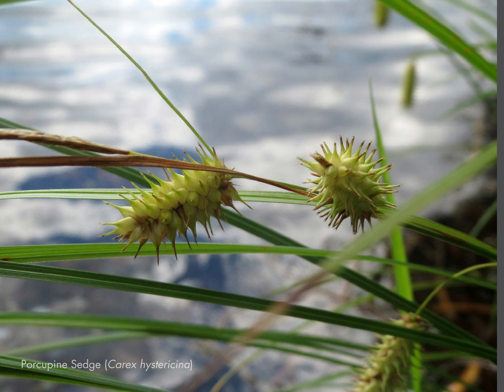
Porcupine Sedge ( Carex hystericina )