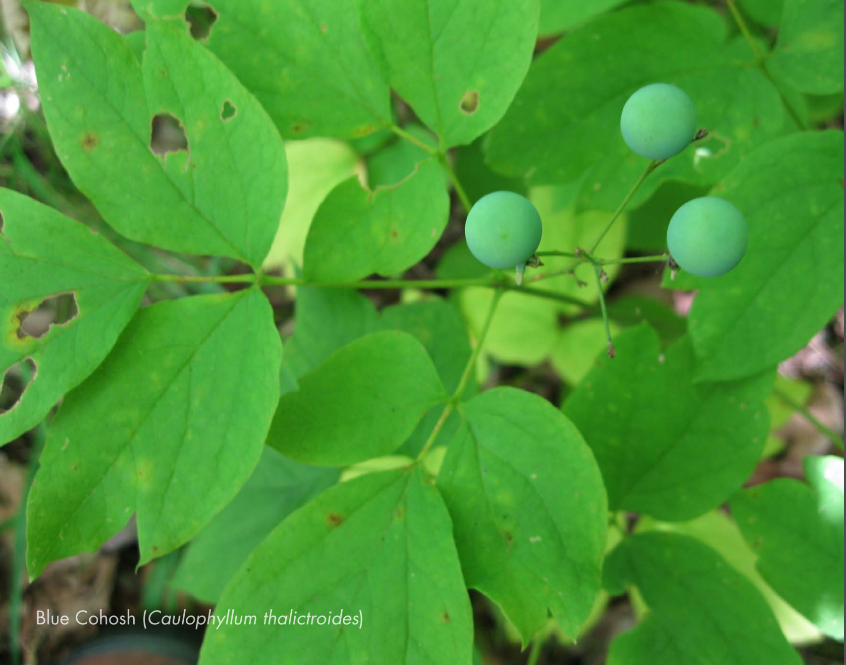
Blue Cohosh ( Caulophyllum thalictroides )