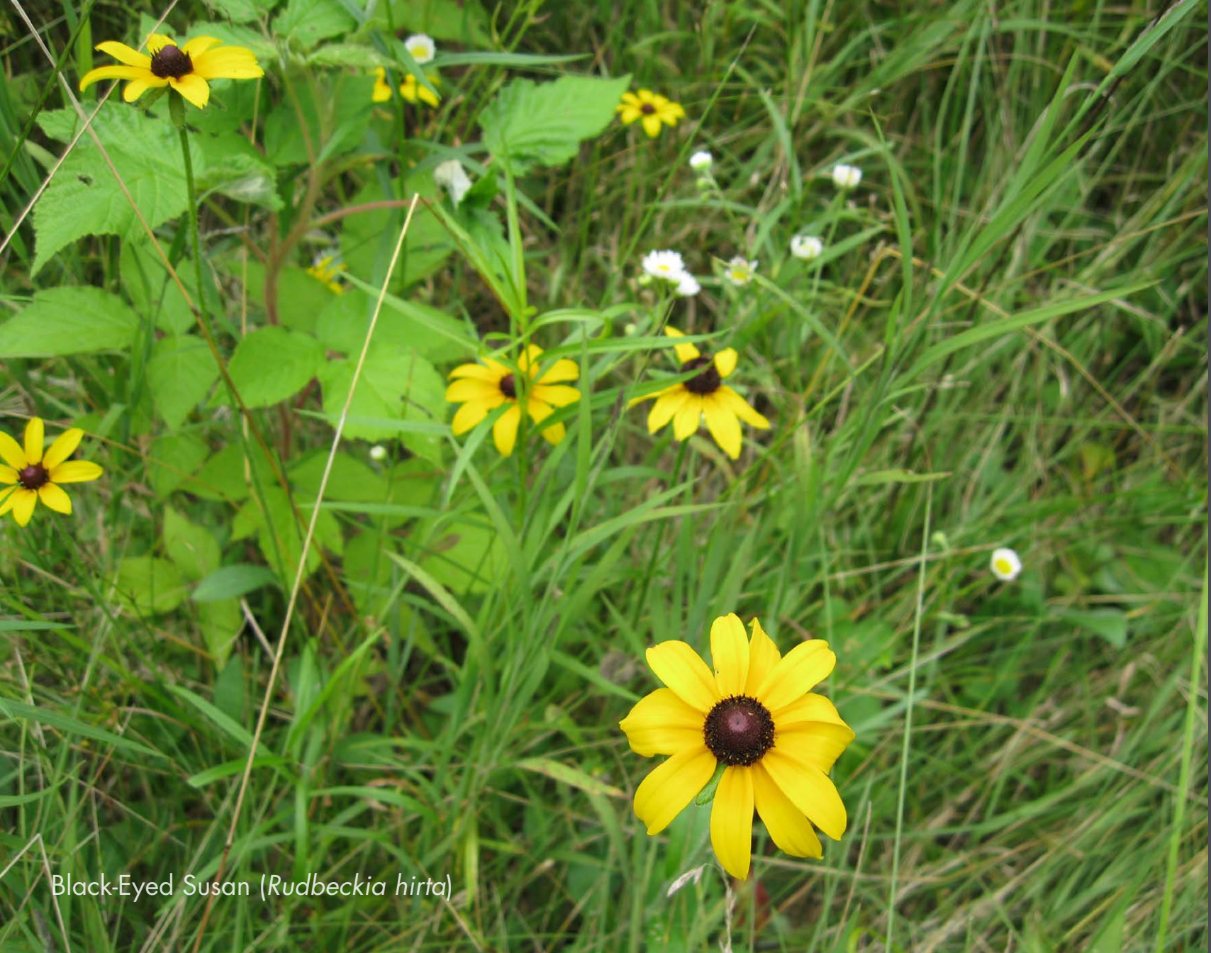
Black-Eyed Susan ( Rudbeckia hirta )