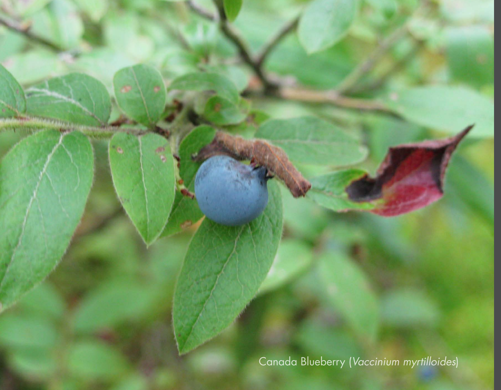
Canada Blueberry ( Vaccinium myrtilloides )