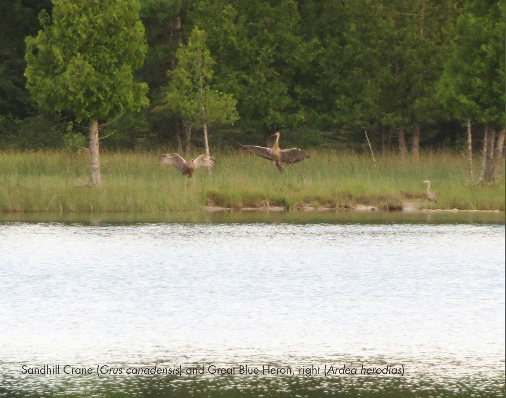
Sandhill Crane ( Grus canadensis ) and Great Blue Heron, right ( Ardea herodias )