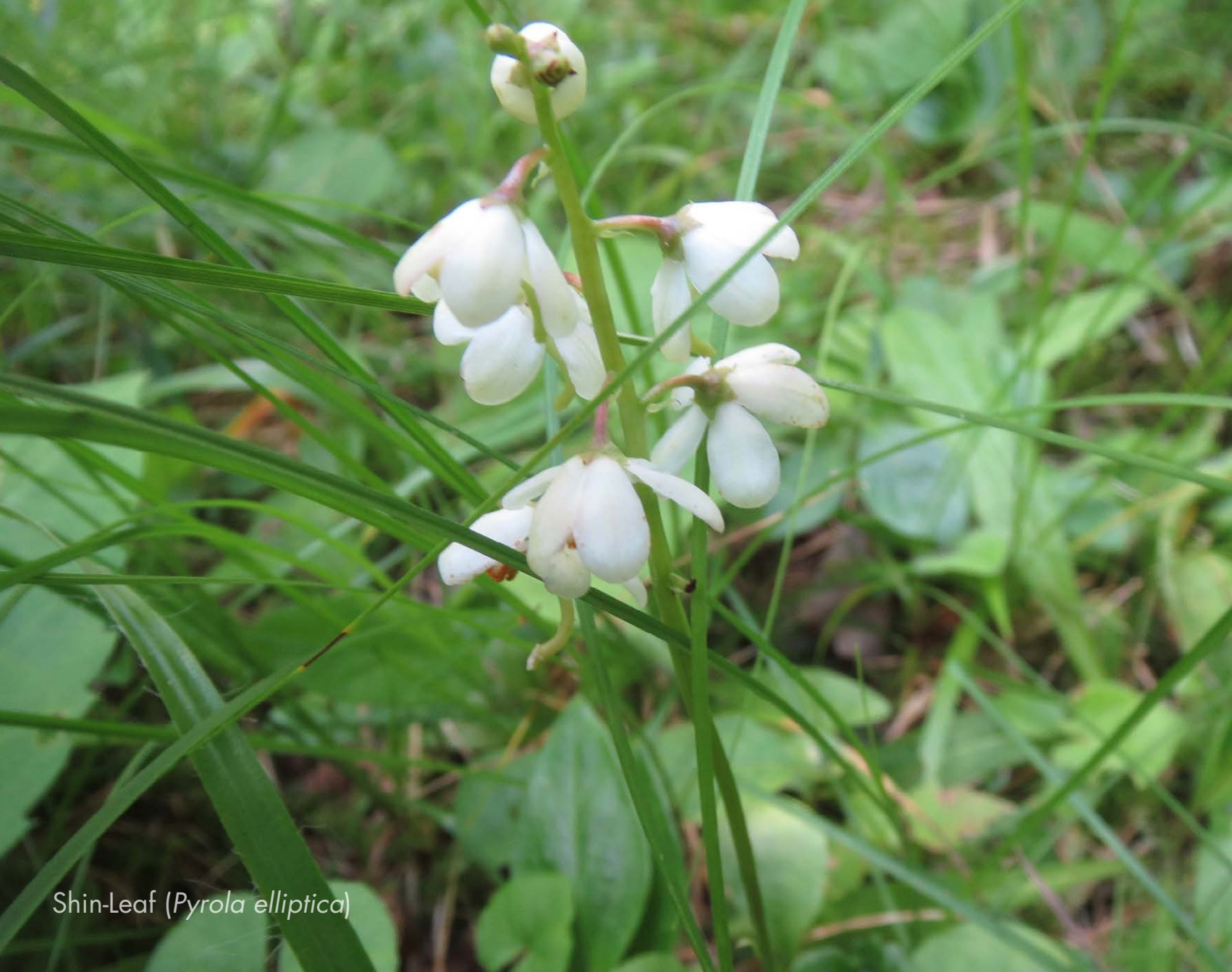
Shin-Leaf ( Pyrola elliptica )