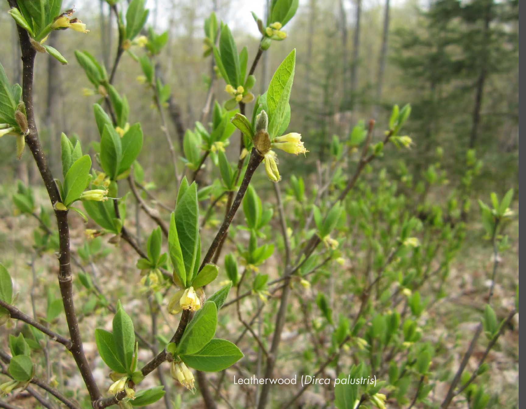
Leatherwood ( Dirca palustris )