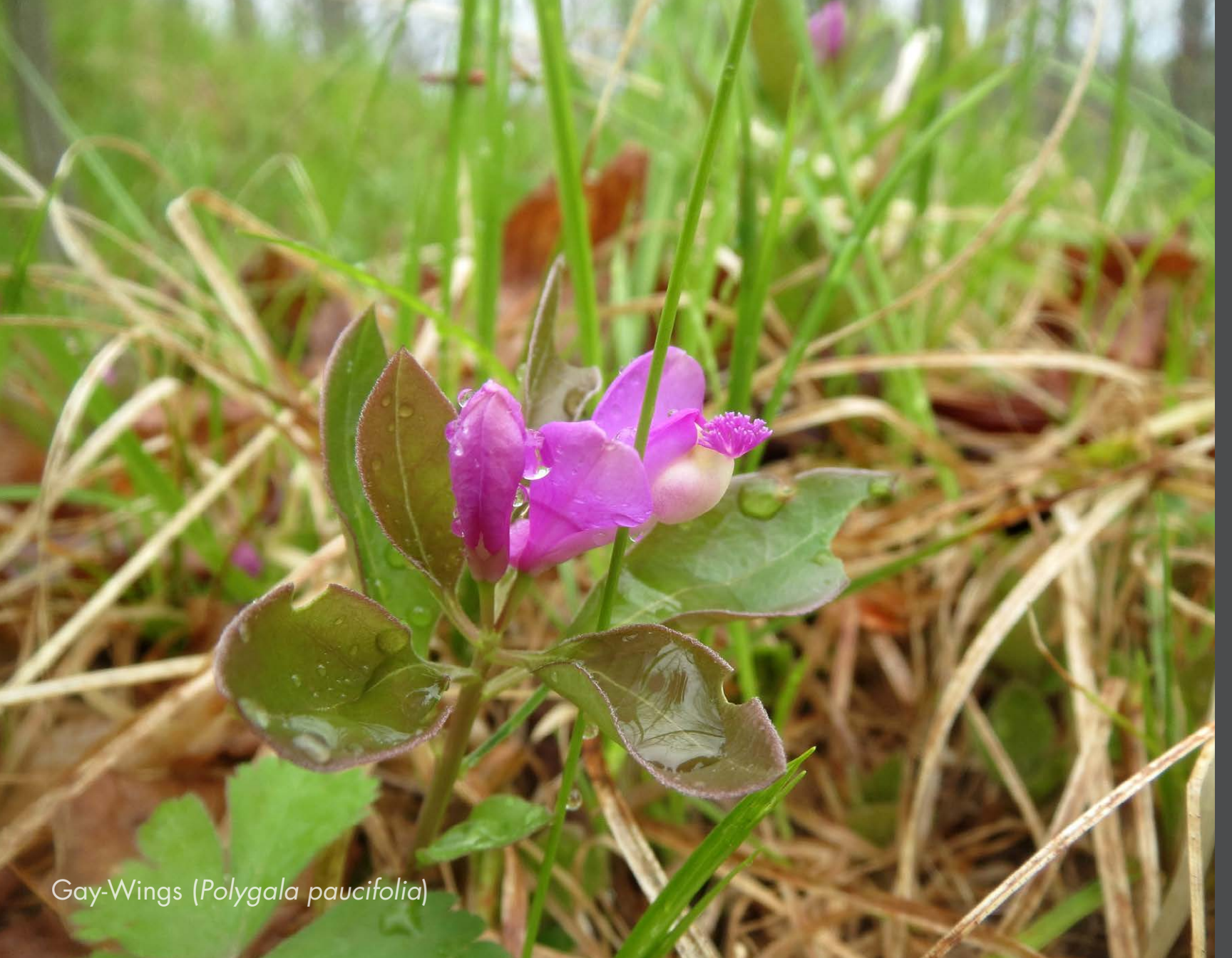
Gay-Wings ( Polygala paucifolia )