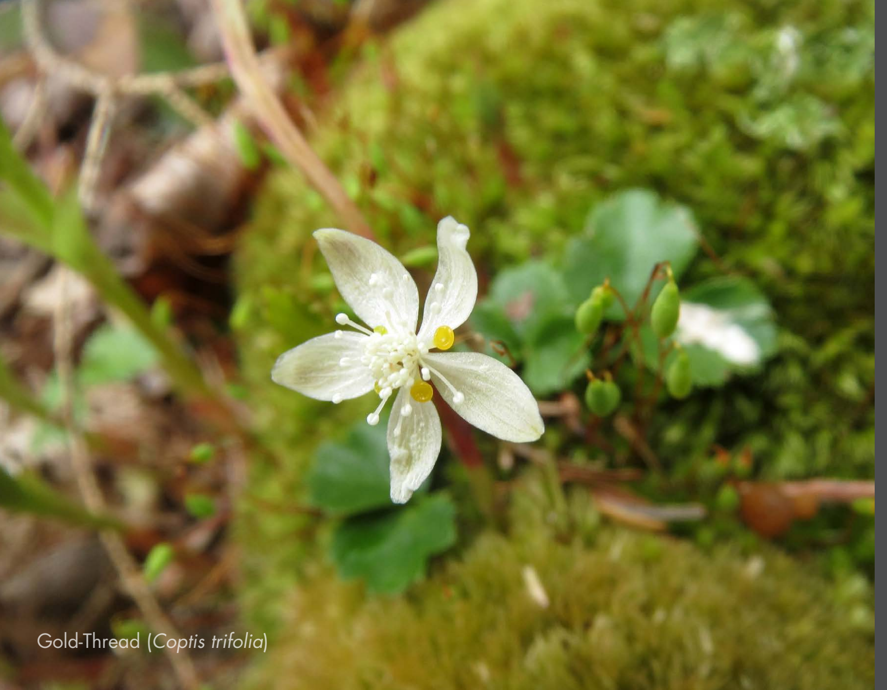
Gold-Thread ( Coptis trifolia )