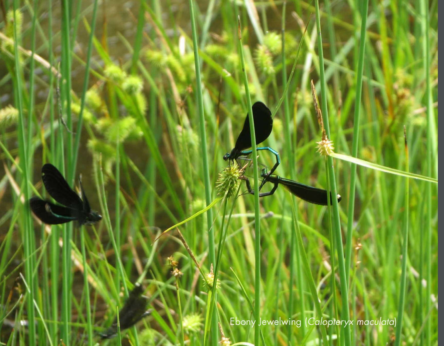
Ebony Jewelwing ( Calopteryx maculata )