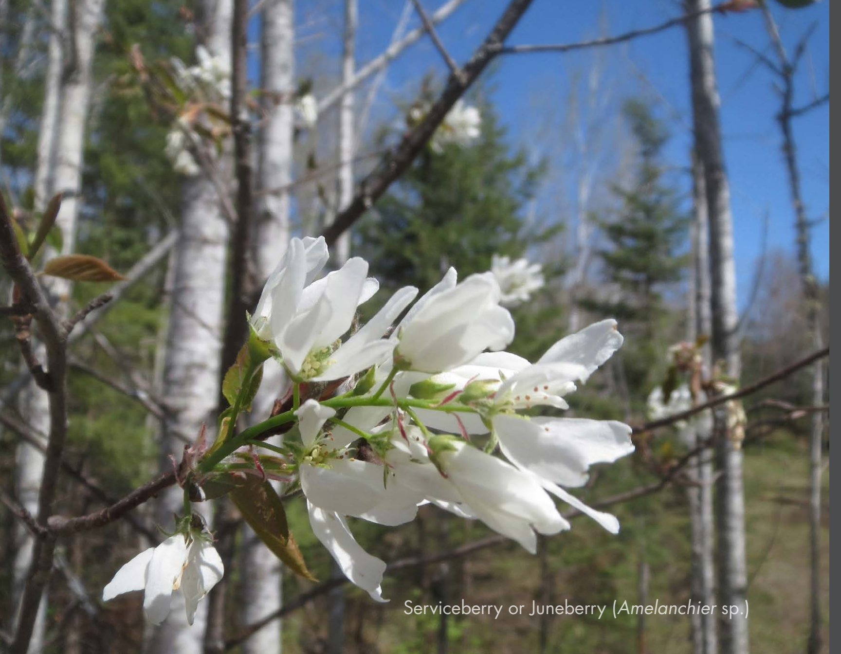
Serviceberry or Juneberry ( Amelanchier sp.)